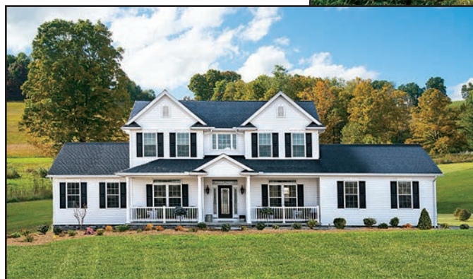
Final color corrected and retouched CMYK Tiff image for printing